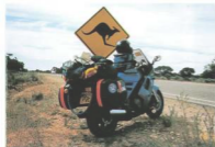
Australia has its own brand of road hazards.

Massive wooden barricades on the graceful