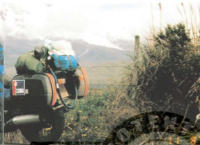
The snow-capped Andes tower over Peru.

arabesque arching over the muddy river could not hide the fresh blood stains on bleached concrete. Trigger happy soldiers with automatic weapons were clearly visible on the far bank. My only option was to ride back, maybe as far as Singapore, about 1,500 miles out of my way, to find an illusive passage to India.