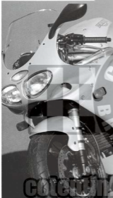
Be methodical. Start at the front of the bike and work your way round

If you own a Thunderbird, Thunderbird Sport or an Adventurer, also check that, when cold, your coolant level settles just above the minimum level mark. The coolant