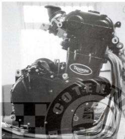
Prototype T595 series engines undergo an exhaustive test programme.

an incorrectly warmed-up motor. Don't try this at home!!!