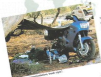
Overnight accommodation, 'both style'.

Sitting on the next table were half a dozen undesirable looking Harley riders. One went outside to inspect the Big Blue Babe, and returned saying to his mates, 'It's OK guys, it's a Trumpet.'